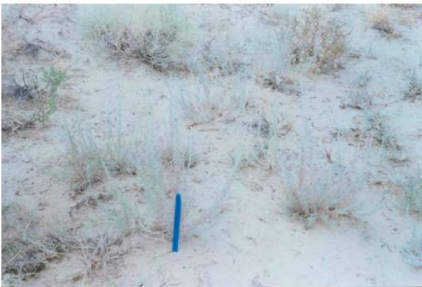
Figure 5: Kochia crops

The cultivation of cereal crops in rain-fed conditions Characteristics of wheat plants of the variety Vitreous 24 and triticale of the Horde variety