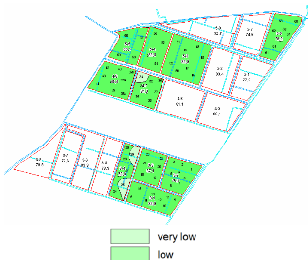
Figure 2: Map of humus content in soil

subject to the process of dehumification (Fig. 2).