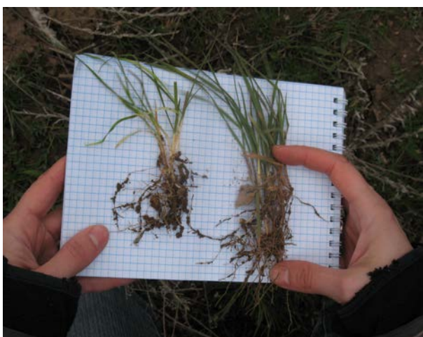
Figure 6: Comparative indicators of tillering: 1. Winter wheat (variety Vitreous 24). 2. Triticale (variety Horde)