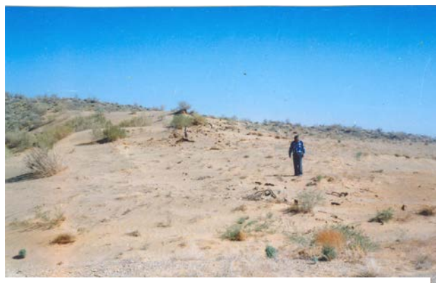
Figure 4: Preliminary examination of the “Abylai” farm territory in the Sarysu district (Zhambyl region)

The results of studies on the development of systems to manage pastures, carried out on different soil types and climatic conditions of the Sarysu district of the Zhambyl region, highlighted the need to create sown pastures using plants of the arid zone and to cultivate alternative crops (Figs. 3 and 4).